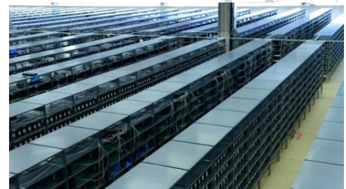
Figure 2: A “mine” of ASIC processors